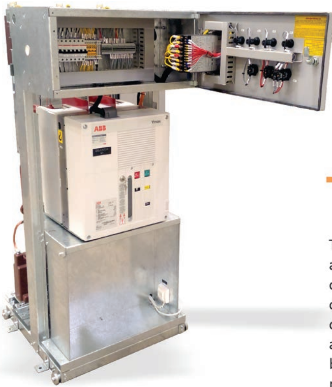
Front View: Control Box and protection; and circuit breaker box to break.